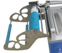
1-17pcs different width feeders