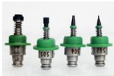
High quality Juki Nozzles