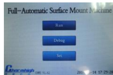
Full Touch screen operation