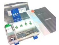
Complete tool box